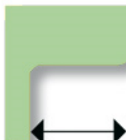
Appliance 4 Double round corner