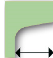
Appliance 6 Inclined round